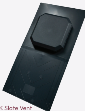
TX 10K Slate Vent