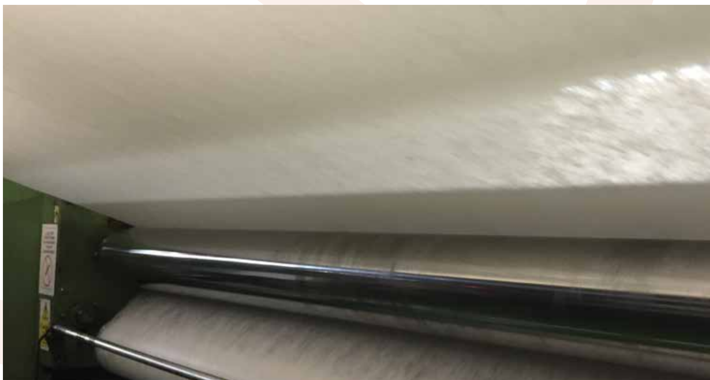
Daltex® spunbond manufacture

Our technology means our materials have air permeability values up to 23% higher when compared to other market leading spunbond nonwovens, resulting in lower energy consumption of powered devices. This reduced motor size improves energy efficiency and generates cost savings. Our customers recognise the inherent benefits of Daltex® nonwoven fabrics, not only to their products, but also to their processes.